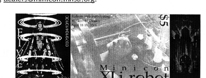
Don't forget, volunteers can earn Dealer Dollars, worth $5 at participating

Now is the time of year to start thinking about Dealer tables are available at a rate of $45.00 per 2 ½ X 6 table. (This price programming for M42. If there's anything you'd does not include membership to the convention). Dealers can reserve tables by